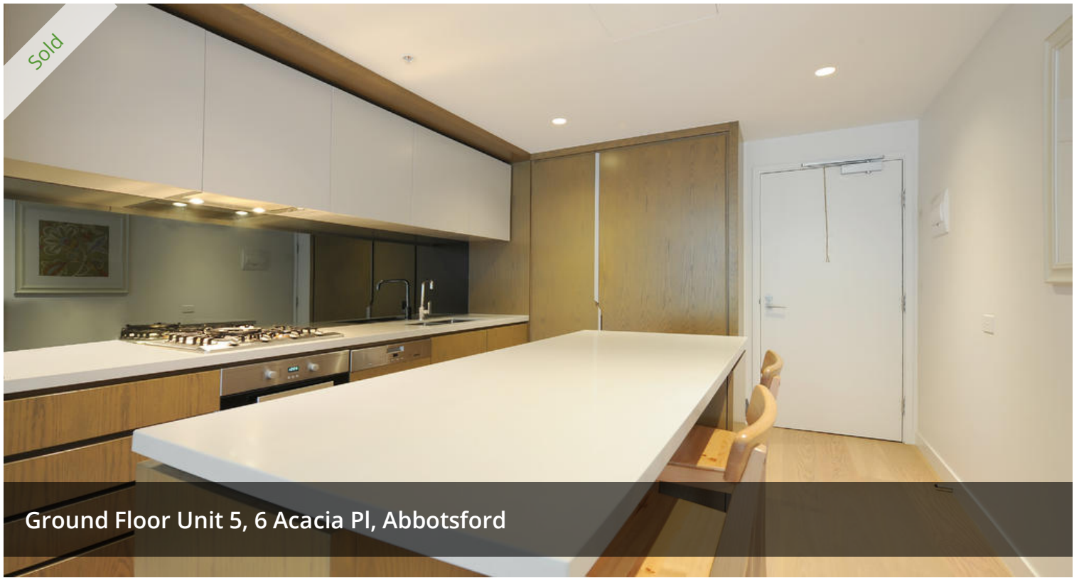
Ground Floor Unit 5, 6 Acacia Pl, Abbotsford