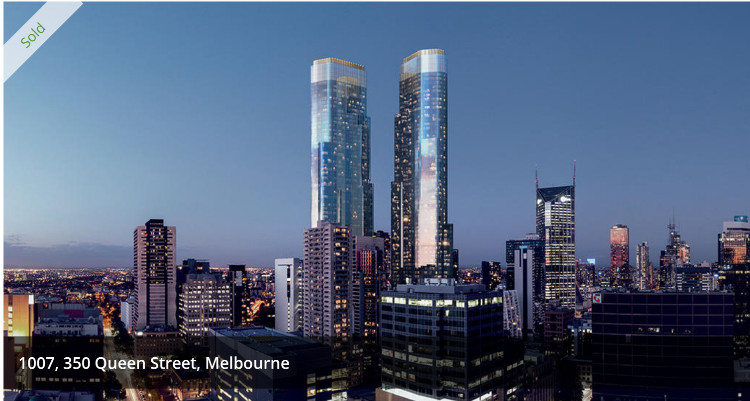
1007, 350 Queen Street, Melbourne